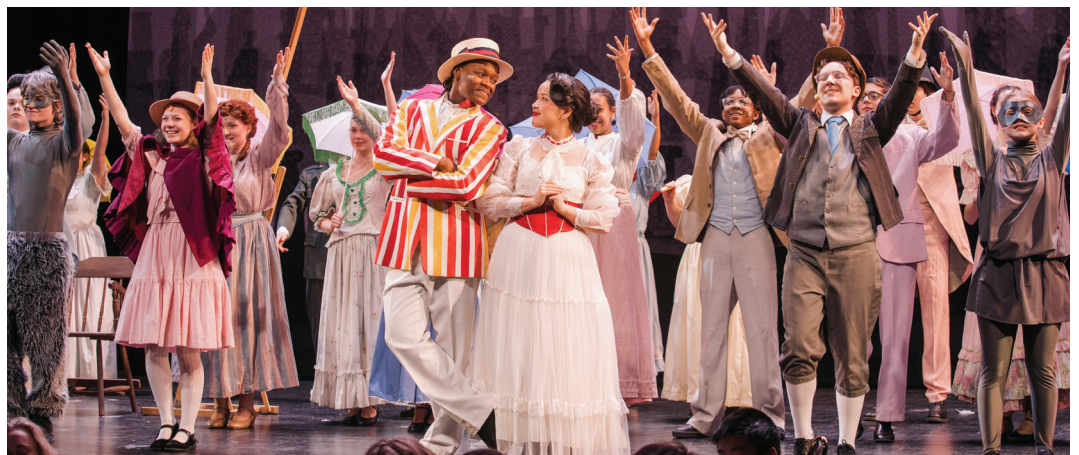
■ Jamesville-DeWitt High School's musical "Mary Poppins" was supercalifragilisticexpialidocious! 105 students in grades 9-12 and dedicated staff worked together to bring the production to life.

Follow the district on Facebook for good news and school highlights.