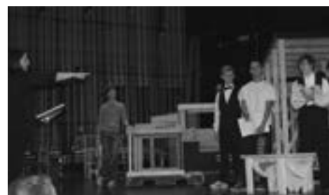
The High School Auditorium stage, seating area, HVAC, and behind-stage areas are among the many parts of the school district that are slated for improvements in the proposed facilities project, which is in the hands of voters on Oct. 18. A public presentation of the project is set for 7 p.m. Sept. 26 in the High School's Large Group Room.