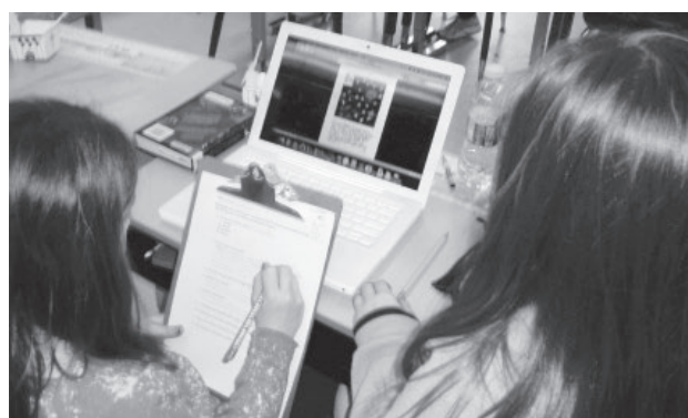
Students, teachers and all staff throughout the district will benefit from a significant upgrade to the technology infrastructure, installed in all schools and buildings late last spring and all summer long.

We also completed a significant upgrade to our technology